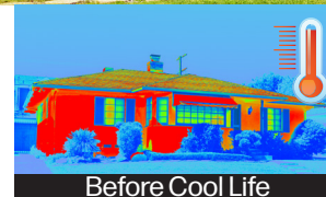
Before Cool Life