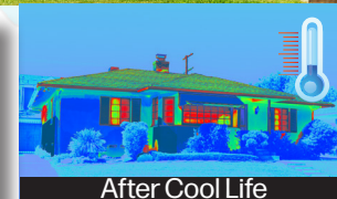
After Cool Life